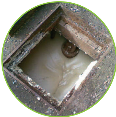
*One of 43 redundant chambers which were filled remotely using expanding polyurethane foam.