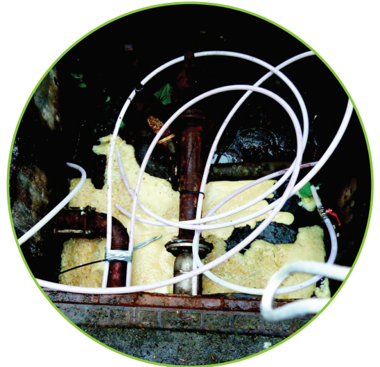
** Access chamber showing where the FOAMBAG'S™ were installed in the active drain system, using umbilical line to remotely foam fill entire section.