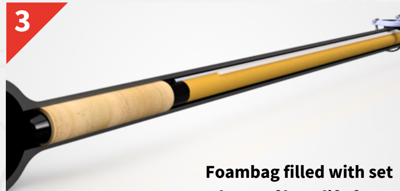
Foambag filled with set volume of long life foam