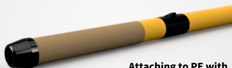
Attaching to PE with internal SVI coupler