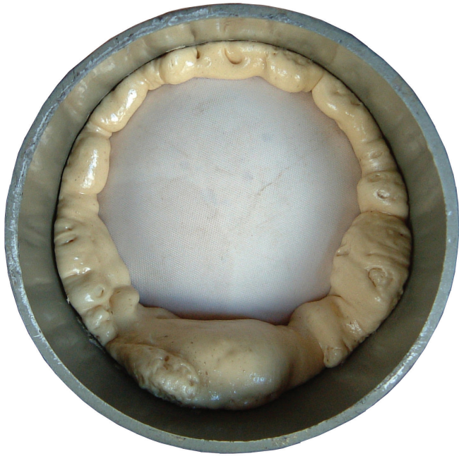
Fully cured FOAMBAG™ demonstrating how a small quantity of foam seeps through the fabric to form an adhesive seal with the pipe

SteveVick International has been carrying out projects in the nuclear decommissioning sector for almost 20 years. Our products and services involve permanently sealing off, decommissioning and diverting all types of pipework, ducts and voids in a wide variety of situations including underground and underwater.