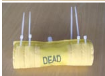
Left: Yellow mini Endseal™ for use in the DEAD service insertion procedure only