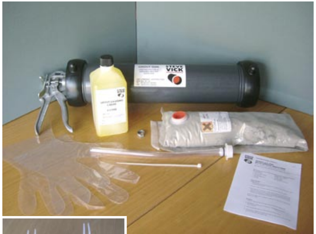
Above: Barrel applicator gun and grout kit