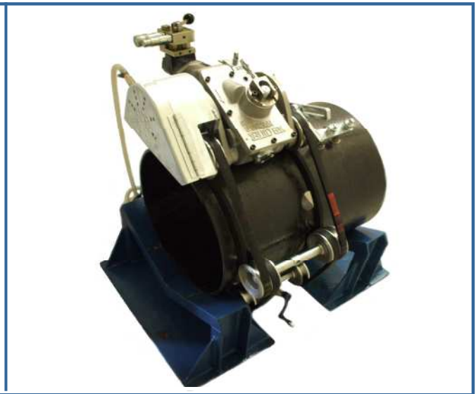
N600 Automatic Pipe Cutter