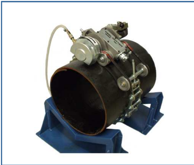
N450 Automatic Pipe Cutter